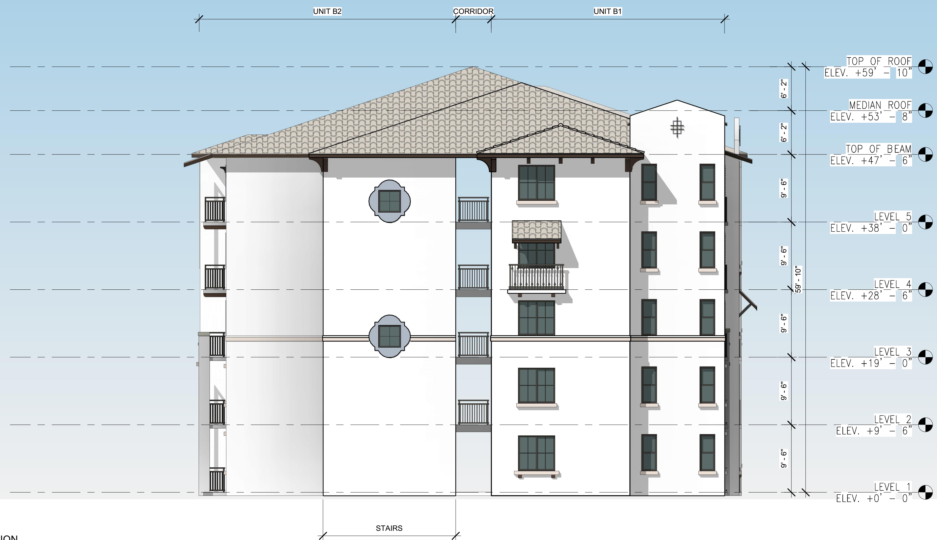
4 SIDE ELEVATION 1/8" = 1'-0"