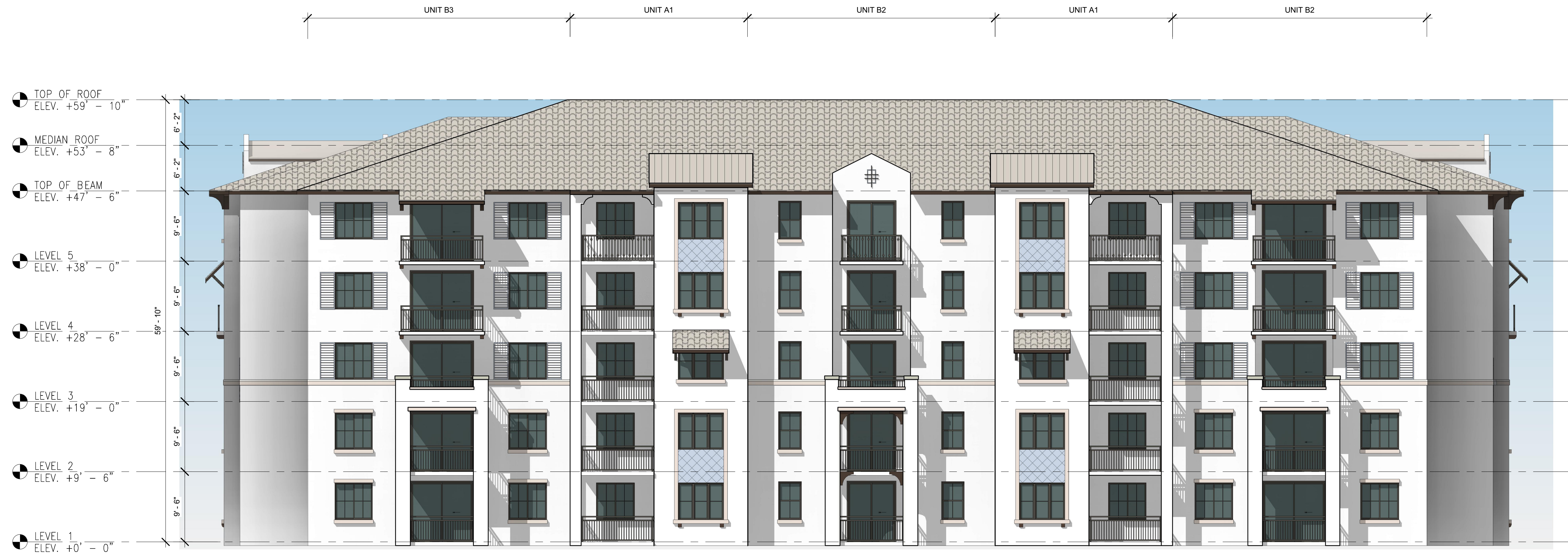
2 BACK ELEVATION 1/8" = 1'-0"